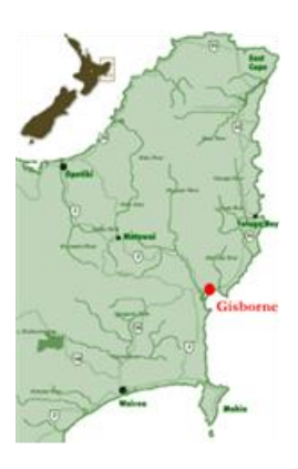
Turanganul a Kiwa